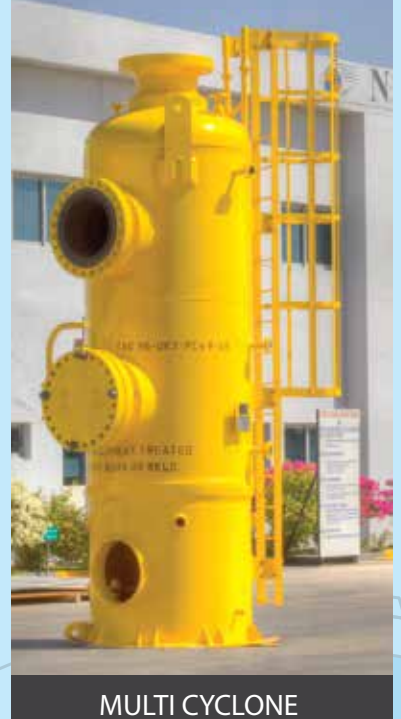
MULTI CYCLONE SEPARATOR- U STAMP