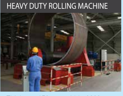
Thickness150mm, width: 3000mm