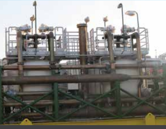
PRODUCED WATER FILTER COALESCER SKID