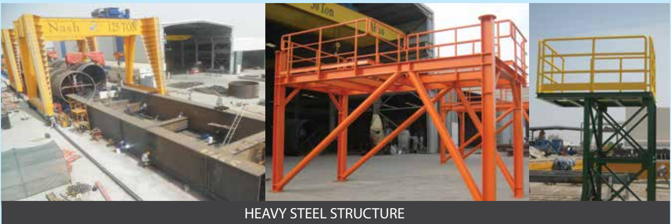
HEAVY STEEL STRUCTURE