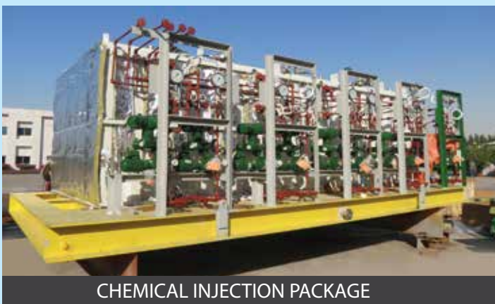
CHEMICAL INJECTION PACKAGE