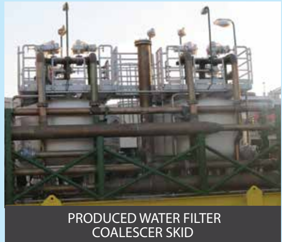
PRODUCED WATER FILTER COALESCER SKID