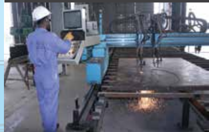
Capacity: 12mtr x 2.2mtr Bed Size Thickness up to 200mm