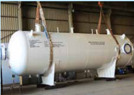
SLUG CATCHER (SS316 L CLAD)