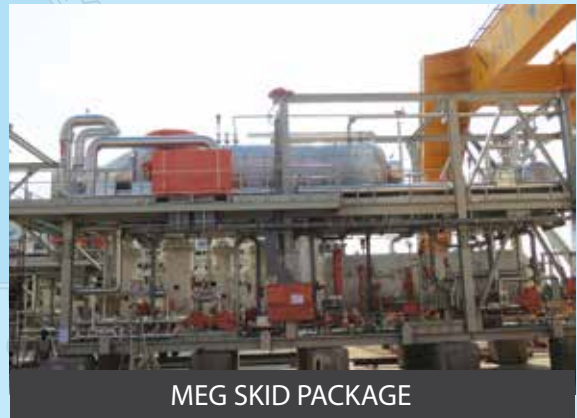
MEG SKID PACKAGE