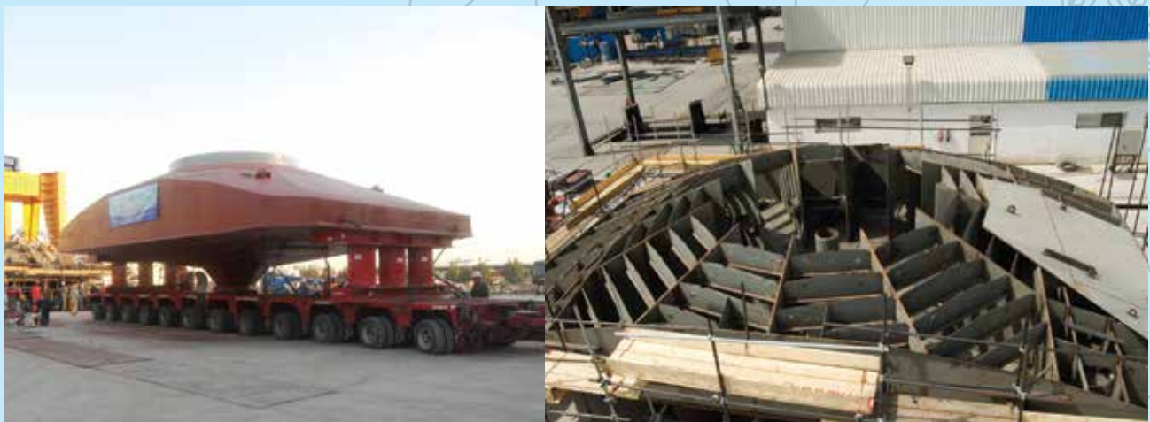
WIND CARRIER - SPUD CAN