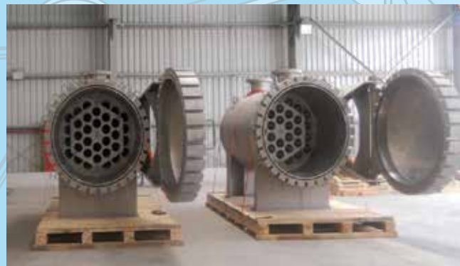
STAINLESS STEEL CARTRIDGE FILTERS