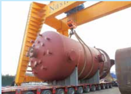
THICK WALL VESSEL