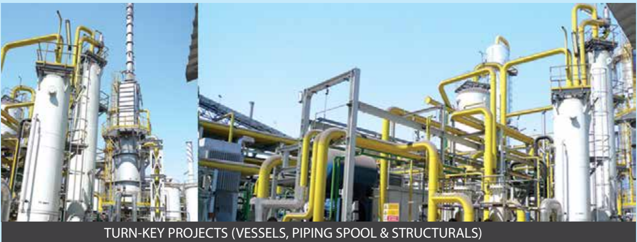
TURN-KEY PROJECTS (VESSELS, PIPING SPOOL & STRUCTURALS)