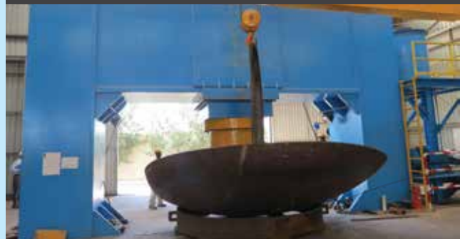
Capacity: 2000 Ton, 6000 Dia x 200mm Thick