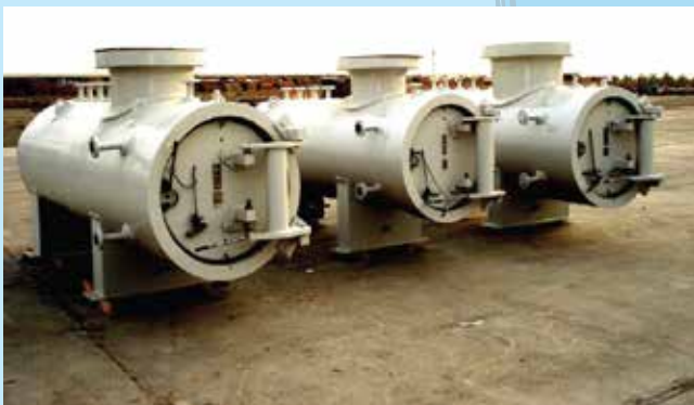
PROCESS HORIZONTAL GAS FILTERS