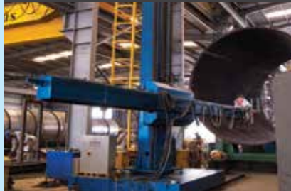
6 mtr Dia x 12 mtr Running Length