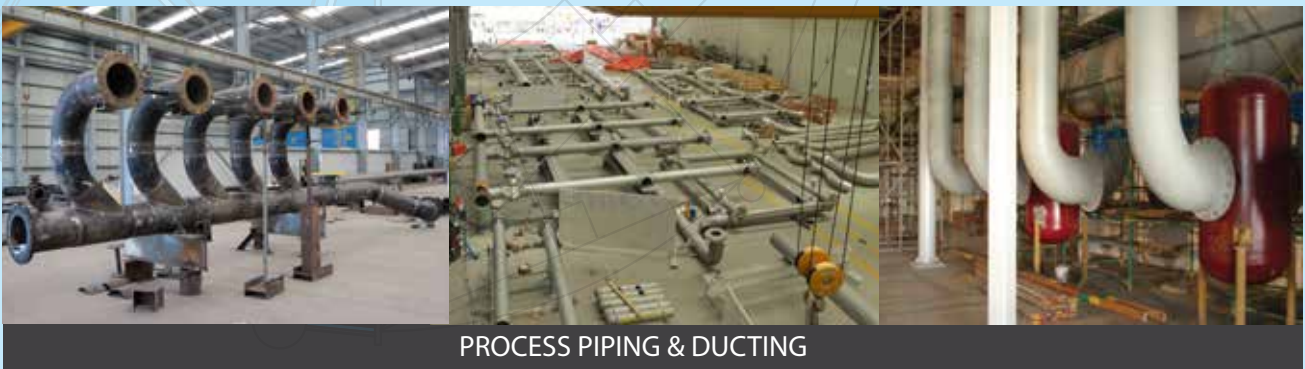
PROCESS PIPING & DUCTING