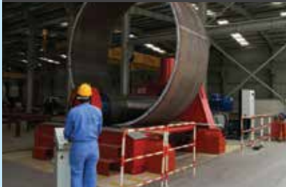
Thickness 150mm, width: 3000mm