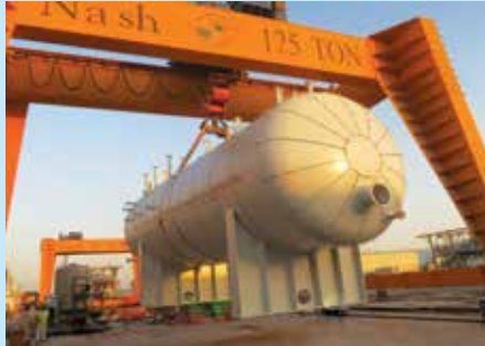
BUFFER DEGASSER VESSEL