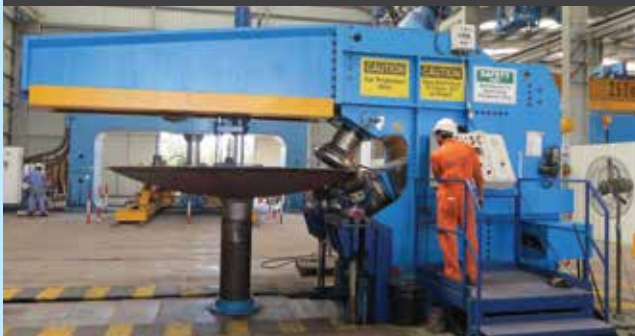
Capacity: 6000mm Dia x 32mm Thickness