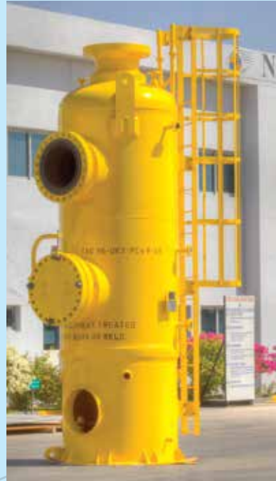
MULTI CYCLONE SEPARATOR- U STAMP