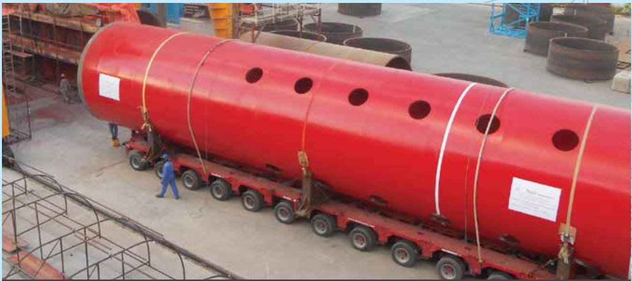
WIND CARRIER JACKUP VESSEL