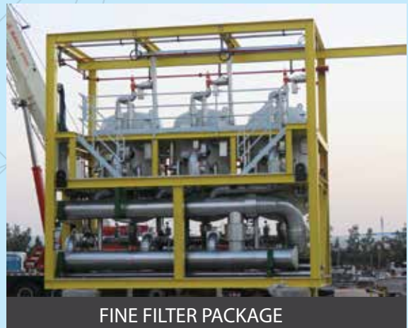
FINE FILTER PACKAGE